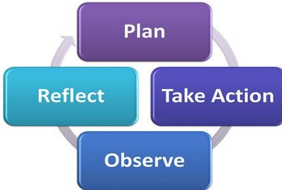
Figure 2. Kemmis and McTaggart 'work cycle' of action research

Stage 1. Plan: The change process mostly involved offering an induction session for the practitioners interested in attending a new series WDGs. The reason for this induction session was that I had the impression that the provision of the WDGs was so unlike the sorts of spaces that these clinicians had elsewhere and were familiar with in their clinical practice. It seemed too big a stretch for them to find a way for them to use a session fruitfully from the start. I had the idea of offering a specifically identified induction session which would be a chance to bridge between what they were familiar with and aspects of what we may be doing in this particular setting. This was not a teaching seminar like other groups they may have participated in during their careers. The idea of the induction session was to provide a space for an informal conversation about the possibilities of what a WDG would offer.