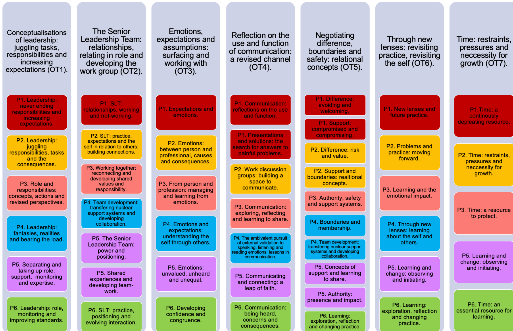
Figure 3. Graphic representation of the overarching themes (OT1-7) and related superordinate themes.