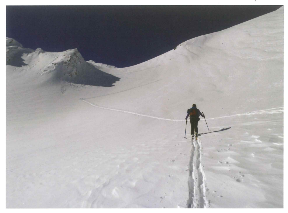
Figure 3. Ski touring. Hannah Burrows-Smith, a mountain guide, leads the way.

(families may have different level of skills, strengths and resources and the guide needs to find the right angle for them). At the end of each section, skiers have to turn and change the direction. If the slope is not too steep, there is an option to gradually change the direction, but most of the time, skiers are required to perform an uphill kick turn (Figure 4). This is a challenging technique that requires knowledge, skills, agility, flexibility and much practice – for those who are interested, there are numerous youtube videos, e.g. How To Perform An Uphill Kick Turn , https://www.youtube.com/