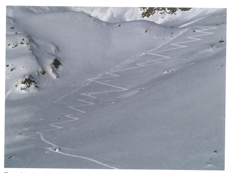
Figure 2. A zigzag ski-touring route

From systemic family-therapy perspectives, these are not mutually exclusive. The recent issue of Context (137) illustrated a breadth of systemic practice in social care across the country and demonstrates how systemic practice is used effectively to reduce risks to children